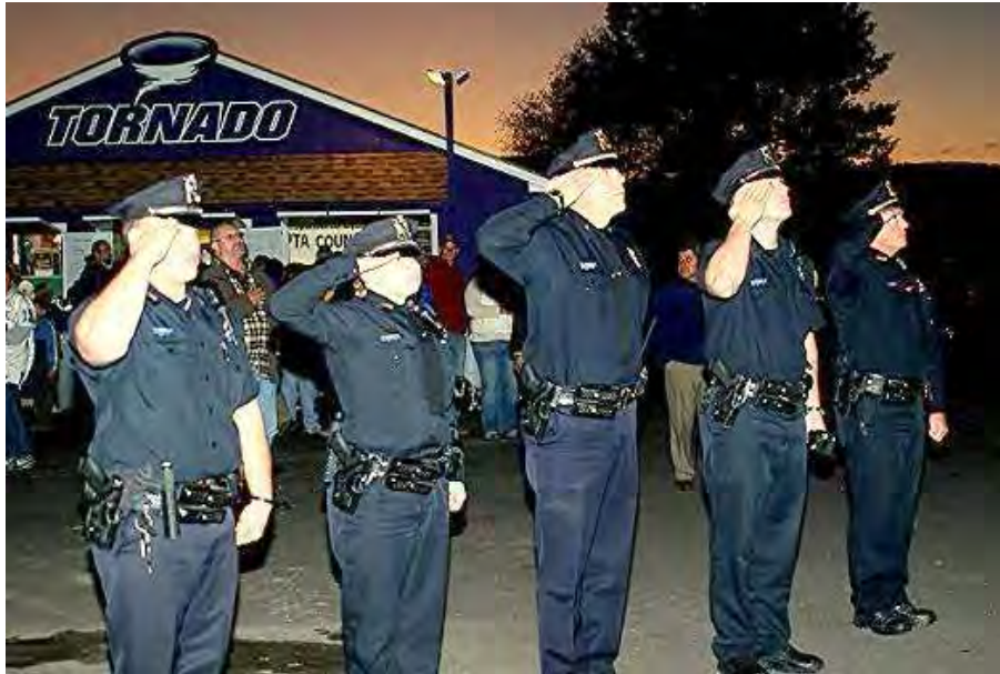
Police Officers Saluting the Colors during National Anthem at a Norwich HS football game.