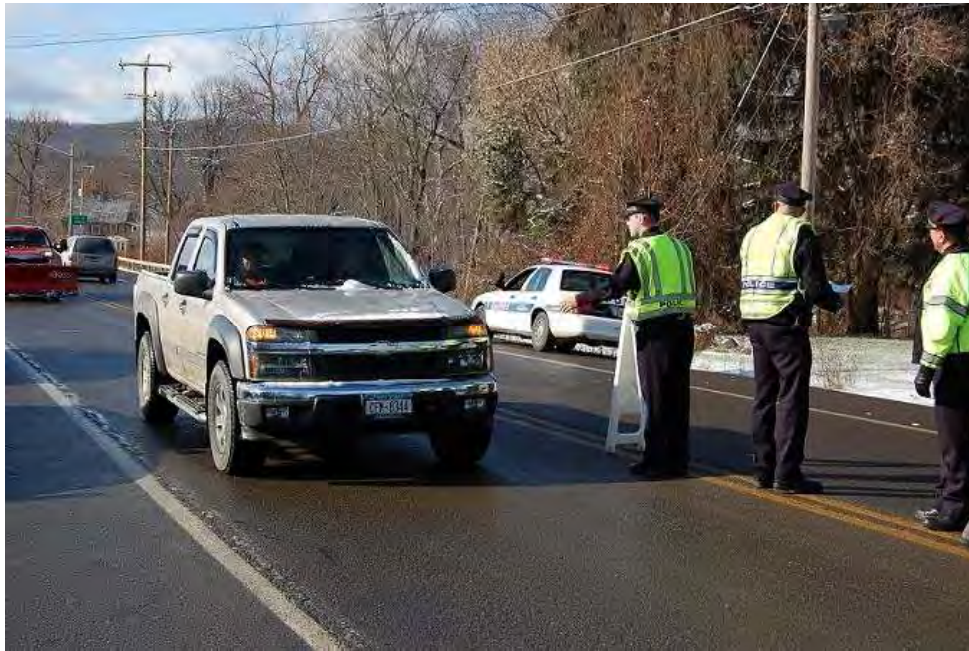
Buckle Up New York (BUNY) Road Check NYS Rte 23 – Rexford St November 21, 2008

Another statewide highway safety campaign is the Buckle-Up New York (BUNY) program. Officers set up a check point to remind motorists to always wear a seat belt and hand out pamphlets on child safety seats and other tips.