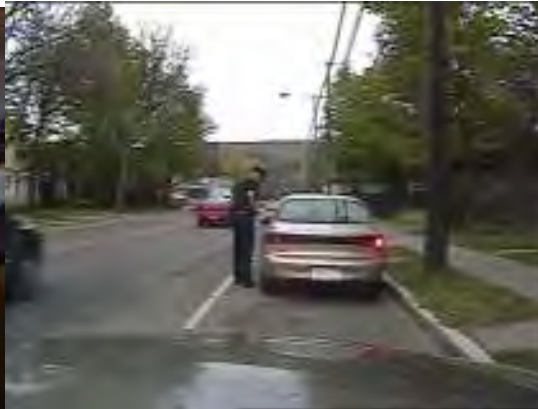
Example of recording from in-car digital video.