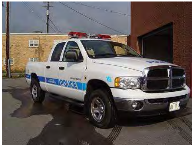
NPD vehicle #18, the primary vehicle used the by the Special Officer, secondary use is by police officers during foul weather.

In addition to his duties of dog control and parking, the Special Officer is a force multiplier to the sworn officers of the police force. The Special Officer also handles a plethora of other duties; funeral escorts, assistance to disabled motorists, posting of temporary 'No Parking' signs at events, traffic control at accident scenes, parades, fires and traffic light malfunctions. The Special Officer is also the first call to replace missing school crossing guards. Because his primary vehicle is a pick-up truck, he is called often to assist in the recovery of large property. This one position is key to the smooth operation of the Norwich Police Department, allowing sworn officers to remain on their primary mission of law enforcement.