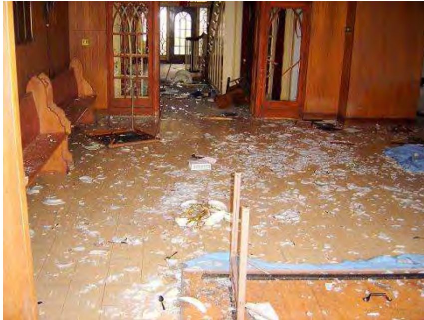
A sample of the indiscriminate damage