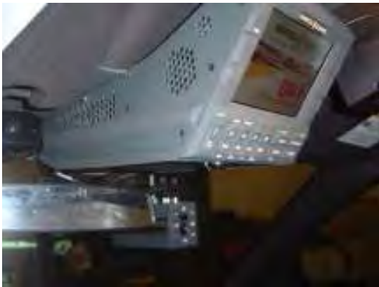
In car video recorder and two lens camera.

Another digital recording device has been installed in the semi-marked traffic car. This in-car video recording device was purchased with a grant from the Chenango County STOP-DWI program. The system records traffic stops and other activity, both visual and audio.