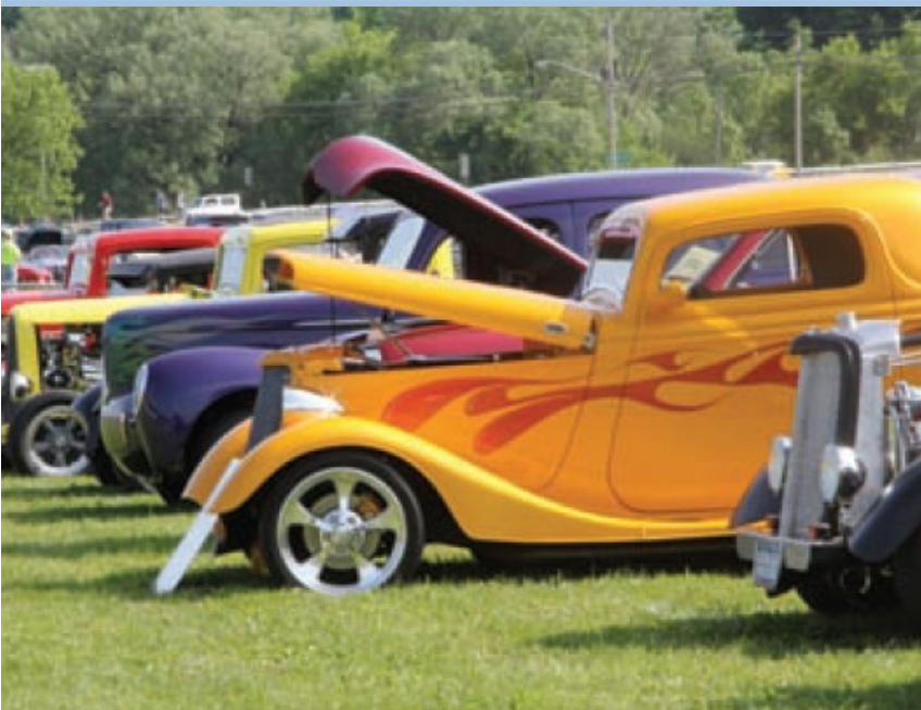
Line up of cars at the Fairgrounds

May 25-27, 2012 - Memorial Day weekend in Norwich is all things cars. Beginning Friday afternoon officers are on duty at the Chenango County Fairgrounds assisting with traffic as car show vendors arrive. At the same time officers are in the downtown area setting up for the B.I.D. Cruise In on the park square. Friday, Saturday and Sunday thousands of car enthusiasts descend on Norwich. During the weekend, teams of four officers alternate between traffic duty on East Main St and patrolling the grounds.