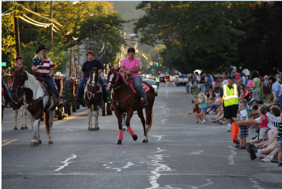
The scene along East Main Street during the Firemen's Parade.

August 7, 2012 - The Firemen's Parade kicks off the start of the week long Chenango County Fair. Norwich Police officers, assisted by County Fire Police set up detours and block streets along the parade route.