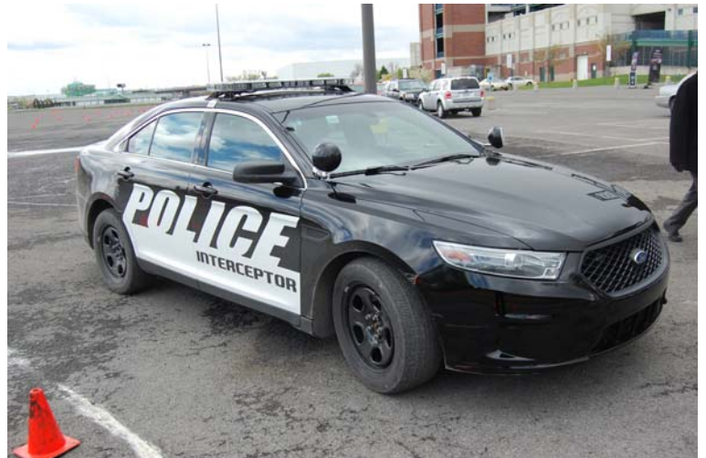
2013 Ford demonstration car with tires worn bald and brakes smoking.