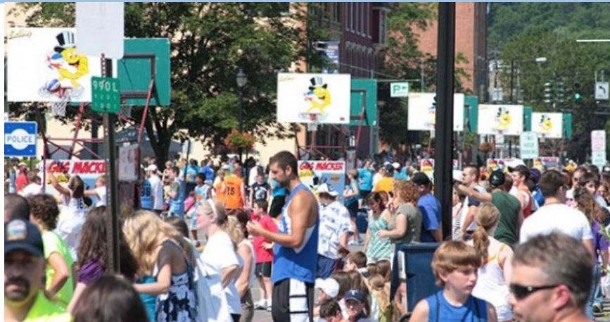
Saturday street scene on East Main Street looking west.

July 6,7,8, 2012 - Police officers, under the direction of Sergeant Gard Turner, close East Main St from North Broad St to Silver St early Friday morning. As soon as the street is closed, scores of Gus Macker basketball hoops and courts are set up. The street remains closed until late Sunday evening as thousands of 3-on-3 players and spectators watch 16 hours per day of street basketball. The Norwich Police are assisted in this event by Fire Police, who also help at many of the parades and events held in Norwich.