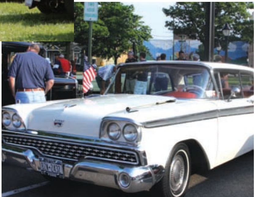
A 1959 Ford on East Park Place.