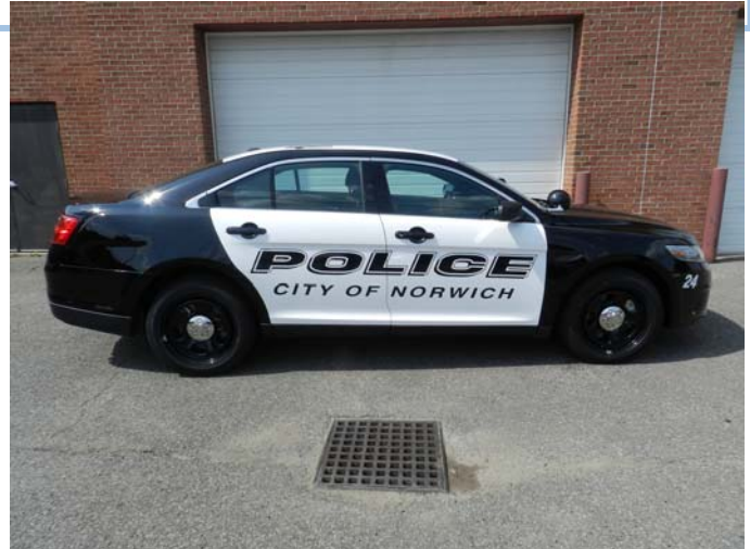
2013 Ford patrol cars

In conjunction with the change of vehicles and colors, the police department also purchased a surplus patrol car from the Village of Greene NY. The Greene Police Dept had ordered a new K9 vehicle and their former K9 vehicle was in much better condition with less miles than the current Norwich Police K9 vehicle. This transfer of ownership was advantageous to both municipalities.