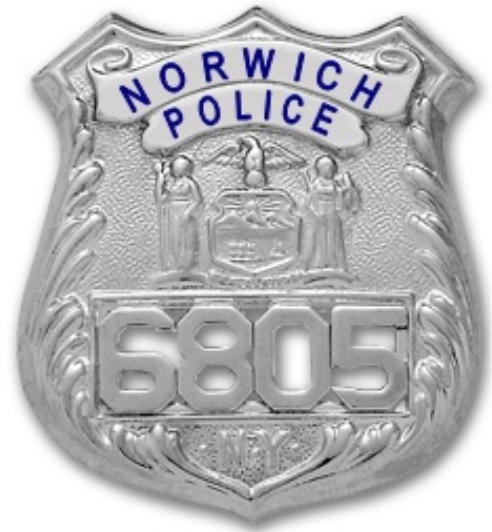
Shield style currently worn by Norwich officers.