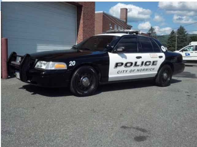
Retrofitted Crown Victoria K9 vehicle, painted and marked to match the newly purchased cars.

In conjunction with the change of vehicles and colors, the police department also purchased a surplus patrol car from the Village of Greene NY. The Greene Police Dept had ordered a new K9 vehicle and their former K9 vehicle was in much better condition with less miles than the current Norwich Police K9 vehicle. This transfer of ownership was advantageous to both municipalities.