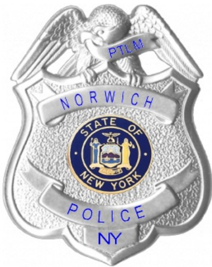
Un-numbered style police shield formerly worn by Norwich officers.

In 2012 Norwich Police Officers and Sergeants were issued shields with individual numbers. This was the practice in the Norwich Police in it's earliest years. Individual shield numbers at some point were ended for reasons unknown. A police officer's shield is more than a symbol of worn on a uniform. It also acts as a form of identification and authority. Maintaining an inventory of this important piece of equipment was difficult with no number, additionally, the loss of a police shield is a serious matter. The need for serial numbered police shield was evident and long overdue.